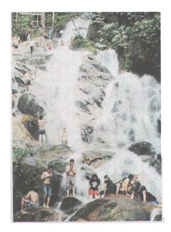
ANCHING Recreational Forest is a forest reserve with a seven-tier waterfall. It is also a popular spot for picnics, camping and jungle trekking. The forest is a haven for various species of birds and monkeys.

ISIT Forest Research Institute of Malaysia to gain insight into Malaysia's tropical flora and fauna. Walk along the nature trails or visit the herb gardens.